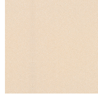
Hampton Bay - 05